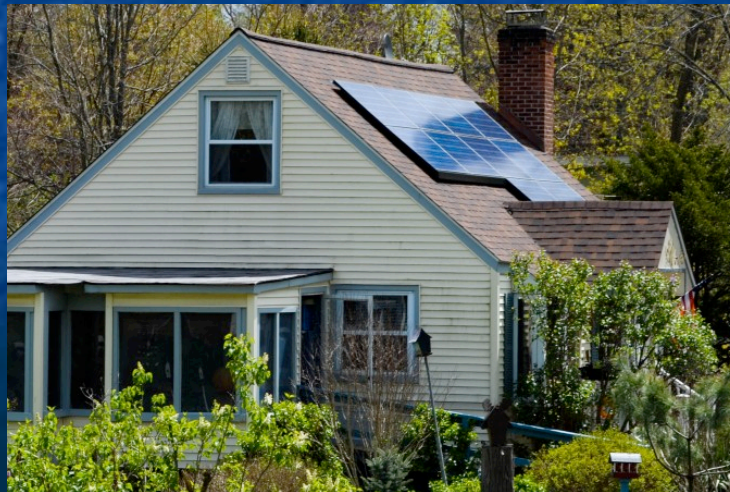
Figure: http://www.theepochtimes.com/ n3/2054773-utilities-partner-with- solar-companies-to-bring-energy-to- the-grid/

Something like this, which appears both do-able and likely affordable: